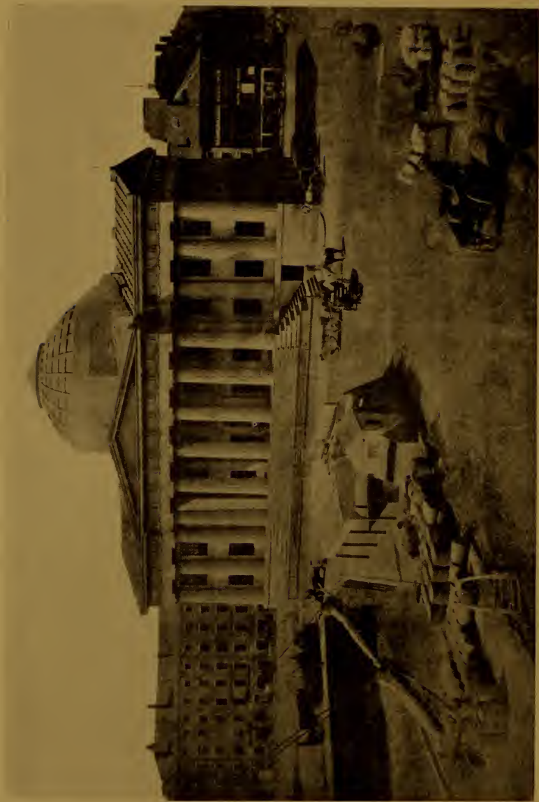
View of the Custom House and Vicinity of Fidelity Trust Company's Site in 1850